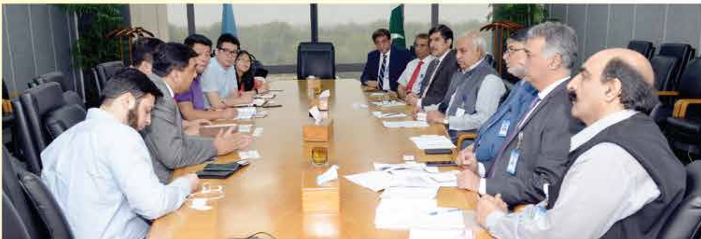
Delegation of CEEC (China) & Khyber Pakhtunkhwa Economic Zone Development Management Company in a meeting with SNGPL Management.